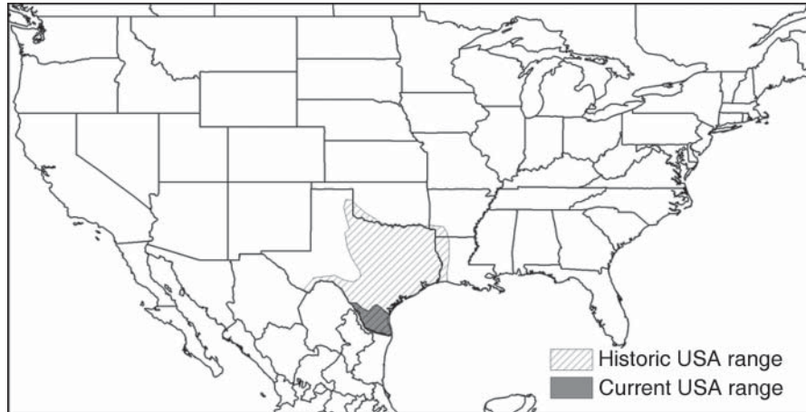
Fig. 1 Historic and current range of ocelot within the United States.