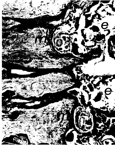
FIGURE 2. Adult Notoedres cati in stratum germinativum of bobcat. Note adult mites (M) and eggs (E). H & E.

marked. Although hyperplasia of the stratum germinativum was not pronounced, rete ridges were prominent in some sections. The inflammatory response was usually limited to lymphocytes and macrophages in the papillary layer of the dermis. Generally the reticular layer of the dermis was unaffected, other than mild hyperplasia of the sebaceous glands and hair follicles. Aside from a few isolated pockets of neutrophils, there was little evidence of secondary infection and/or an acute inflammatory response. In general, the reaction in this host was confined to the epidermis and upper dermis and consisted of mechanical destruction and a chronic inflammatory response.