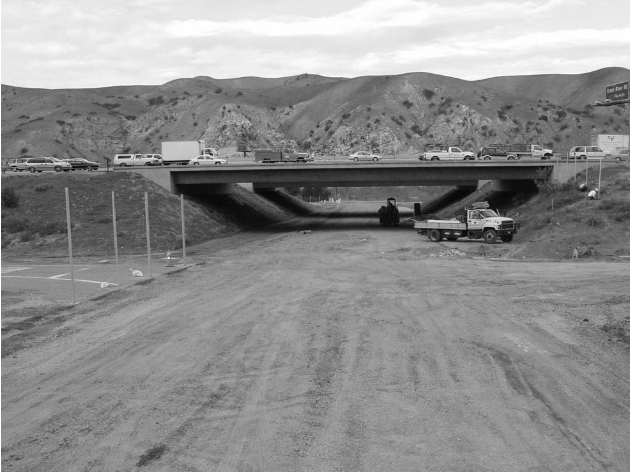
Figure 4: An interchange on the Riverside Freeway (SR 91) being converted into a wildlife crossing in February 2003, to facilitate movement along the linkage between the Santa Ana Mountains and the Chino Hills. Although this is not one of our 15 priority linkages, this illustrates the feasibility of the enhancements that we will recommend in some linkage areas. California State Parks is investing $1.5 million to restore natural vegetation and the Coal Canyon stream channel through the underpass.