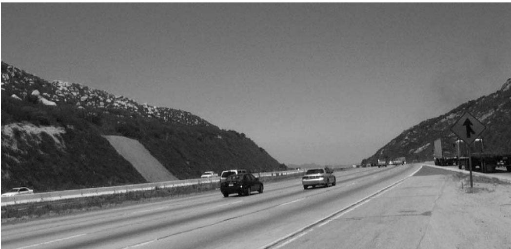
Figure 3. (A) At the bottom of the fill slope, 0.6-m diameter pipes (not visible) accommodate the flow of Cherry Canyon, the largest non-urbanized drainage crossing Interstate 5 along the linkage between the eastern and western Sierra Madre. A bridge here would serve many focal species. (B) Several pumas have been killed in vehicle collisions on this portion of Interstate-15, where the freeway crosses the Santa Ana-Palomar linkage. Because the freeway is already cut into bedrock here, an underpass is not feasible, but a vegetated overpass would facilitate movement of most focal species.