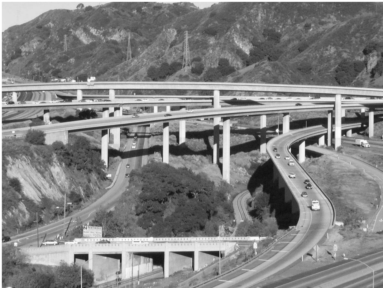
Figure 5: The confluence of four highways, a railroad line, high-voltage power lines, and microwave communication towers, as seen from the edge of the California Aqueduct, which moves water 440 km from the Sacramento River delta into the Los Angeles Basin. Our project intends to add one more layer of infrastructure to this scene by protecting and restoring the ridge in the background, which provides the only wildland link between the Santa Susana Mountains (off left edge of the photo) and the San Gabriel Mountains (off right edge of photo).