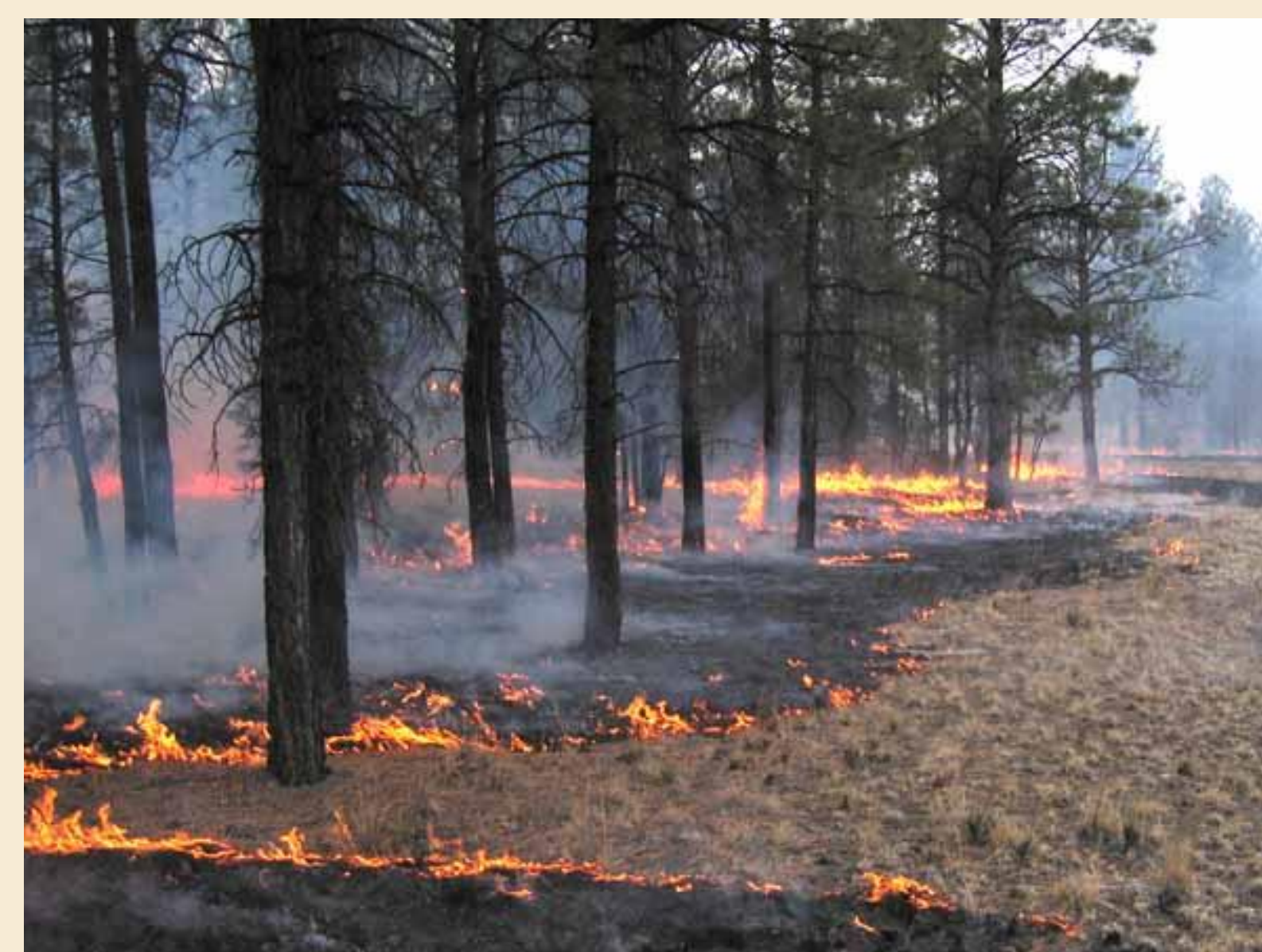
Prescribed fire in ponderosa pine stand

Fire-damaged trees can be killed by bark beetles that otherwise would have survived (McCullough et al. 1998, McHugh et al. 2003). An unacceptable level of tree mortality may occur after a controlled burn as a result of weakened tree defenses (Sullivan et al. 2003). Breece et al. (2008) monitored tree mortality in the Birds and Burns Network sites (coordinated by the USDA RMRS) for the first three growing seasons (2004-6) after experimental implementation of prescribed fire treatments. In this project, we continue to monitor these sites and establish new study sites to: quantify long-term effects of operational prescribed fire on bark beetle attacks in ponderosa pine-dominated stands of Arizona and New Mexico; identify species of bark beetles present in prescribed burned and unburned ponderosa-pine dominated stands; assess the utility of using measures of pre-fire bark beetle populations as predictors of future bark beetle caused mortality at prescribed fire sites; and quantify stand conditions in ponderosa pine dominated stands prior to igniting control burns.