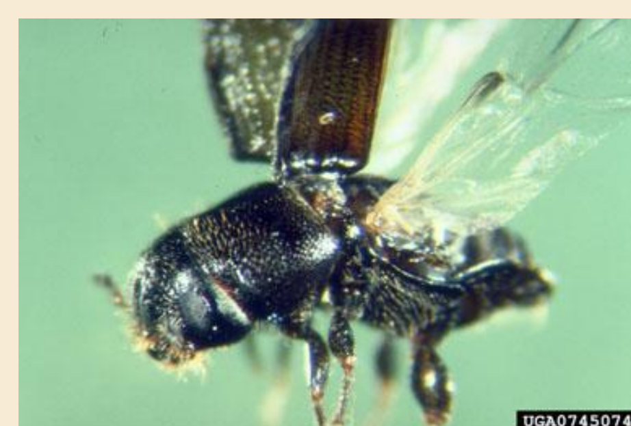
Dendroctonus sp. in flight